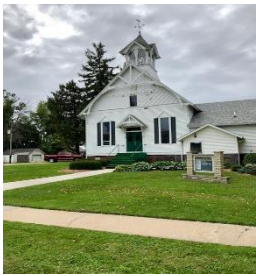
Canton, MN; Canton-Scotland