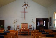
Utica, MN; First