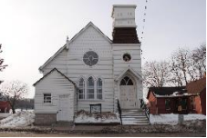
Utica, MN; First