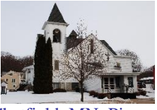
Chatfield, MN; Pioneer