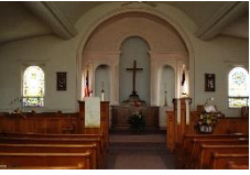
Chatfield, MN; Pioneer