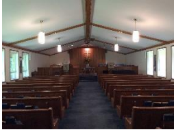
Madison, WI; Dale Heights