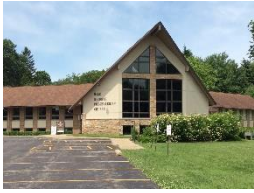
Madison, WI; Dale Heights