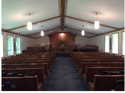
Madison, WI; Dale Heights