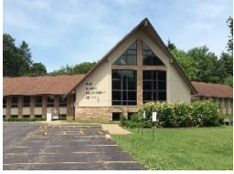
Madison, WI; Dale Heights